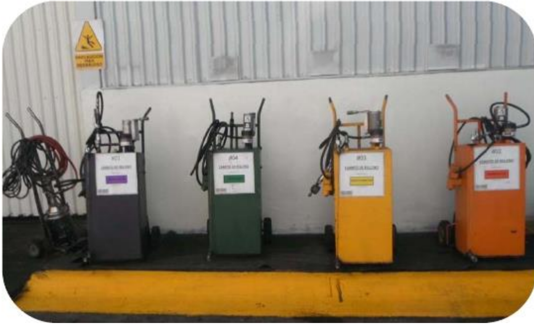
Top-up trolleys identified by a color-code and mentioning the name of the oil transported