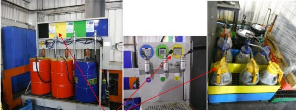
Three colors allow hydraulic, gear and fire-resistant oils to be differentiated

Certain categories of lubricants can command special attention: