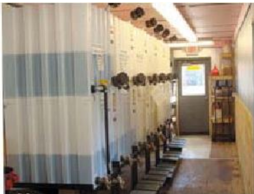
Polyethylene bulk tanks