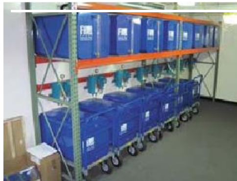
Metallic bulk tanks