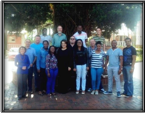
Delegates of Lubrication Engineering 96 at Sicas Guest House